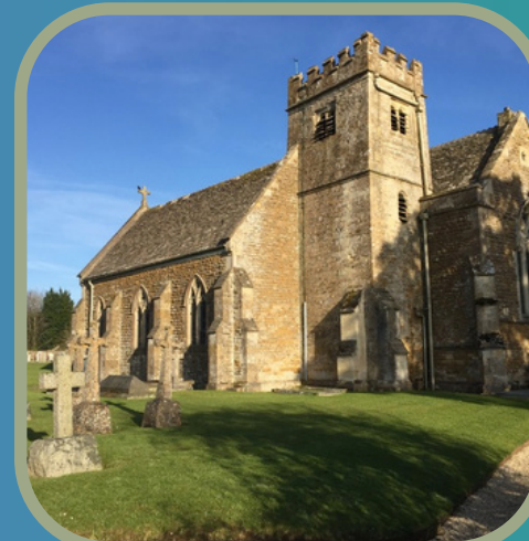
St Peter Little Rissington