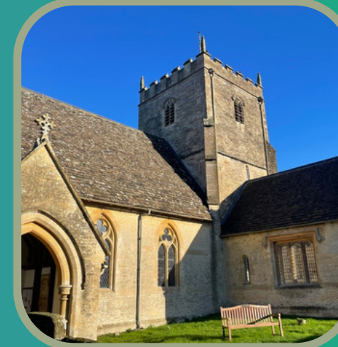
St John the Baptist Great Rissington