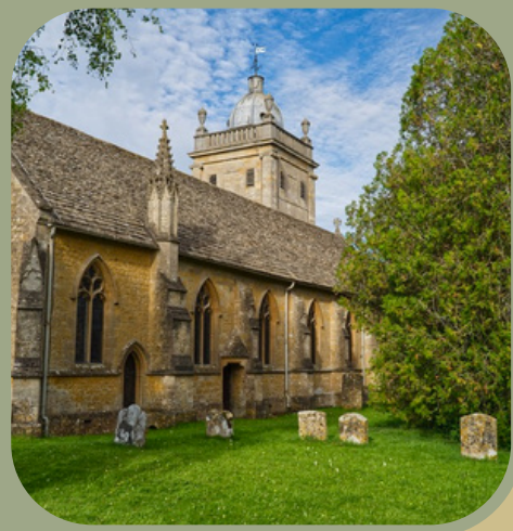
St Lawrence Bourton