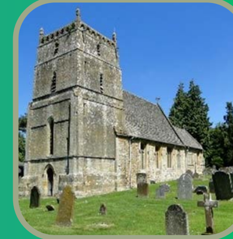
St Laurence Wyck Rissington