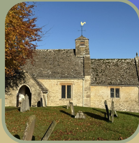
St James Clapton