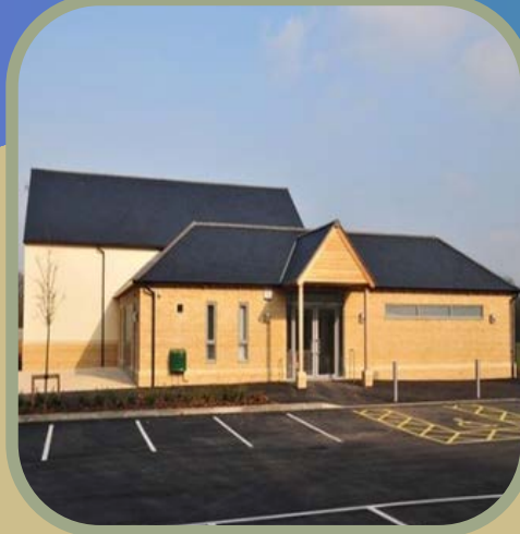
The Church in Upper Rissington